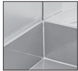
Fully Welded Interior with 3/8 Radius Corners